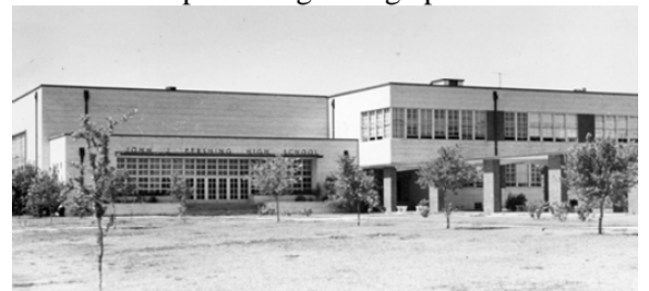
Pershing Middle in July 1954. Perhaps someone can clear up why the school is referred to as a high school in this picture.