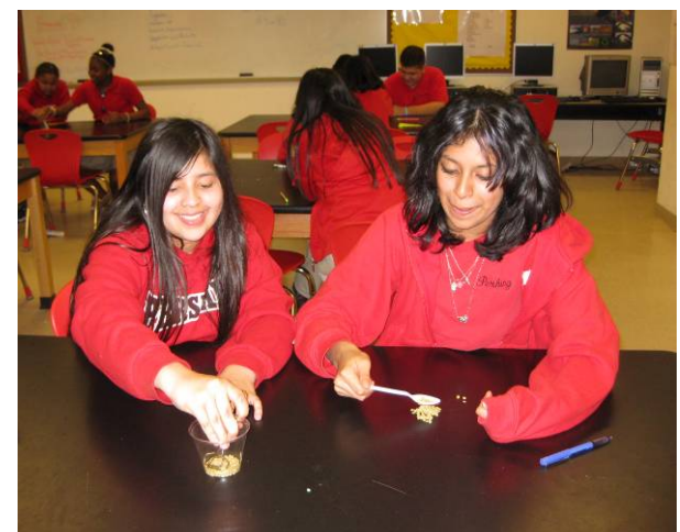
7-2 Students participate in Woolly Booger Lab