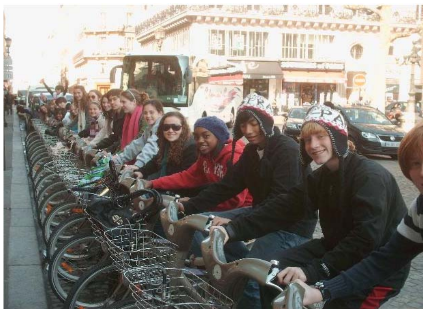
Enjoying the Bikes in Paris