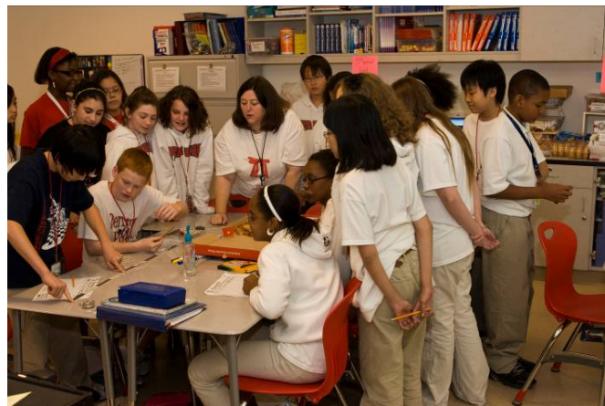
6-3 Students Celebrate "Pi Day"

In Ms. Pipes and Mrs. Hart's classes, students have been learning that pi, Greek letter ( \pi ), is the symbol for the ratio of the circumference of a circle to its diameter. Students learned about Pi Day and how it is celebrated by math enthusiasts around the world on March 14th. \pi = 3.1415926535\dots Cluster 6-3 math classes celebrated this holiday on Thursday and Friday, March 11th and 12th. Students did fun activities to celebrate the fascinating number 3.141592... Students performed measurement activities using round foods, such as donuts, cookies, and pizza; sang songs about circles and Pi; and competed to see who could recite the most digits of \pi from memory.