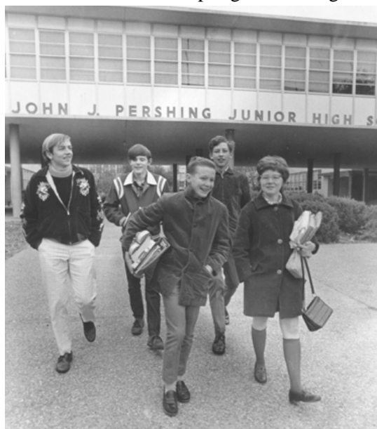
Jurst pipes led to a break down of Pershing's heating system, giving students the day off on Jan. 19, 1970.