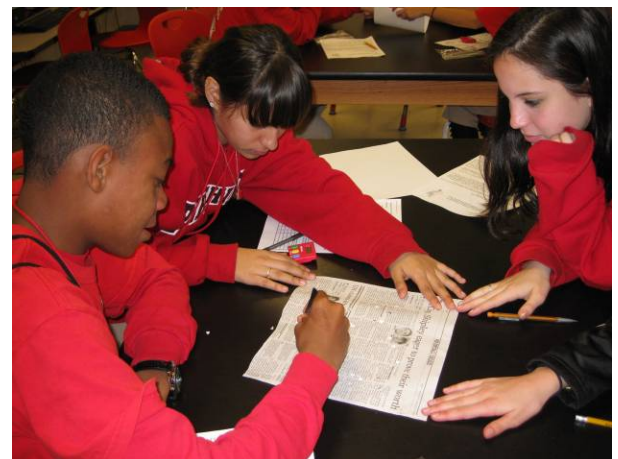
7-2 Students participate in Peppered Moth Lab

In Texas history we have just been annexed to the United States! With the Texas Annexation Treaty of 1845, it was stated that Texas had the option of being divided into five states. Students are busy showing off just how creative they can be by taking on this important and monumental task. They are working in groups to divide Texas into five states. In addition, they are coming up with names for these "new" states, as well as other key highlights such as: state song, state animal, state food, state motto, etc. Students will be compiling this information into a brochure format and sharing their creations with their classmates. Soon, we will be moving into our mini-unit on the Texas Rangers. Students will research and pinpoint key Texas Ranger figures throughout history. It is because of Texas Rangers that famous criminals Bonnie and Clyde were captured!