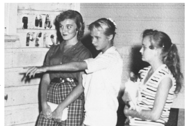
Closeup of above photo. Note girl on right holding a cat.