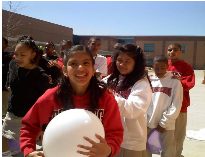
"Meet-in-the Middle" club members enjoy time with their "buddies"